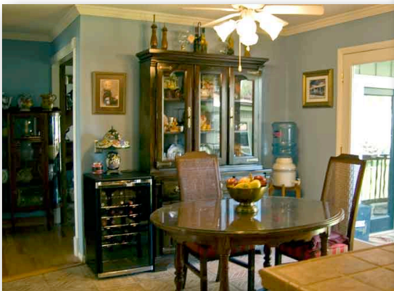
Eat In Area of Kitchen