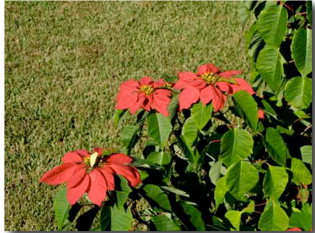
Palm trees and poinsettias on the subject property