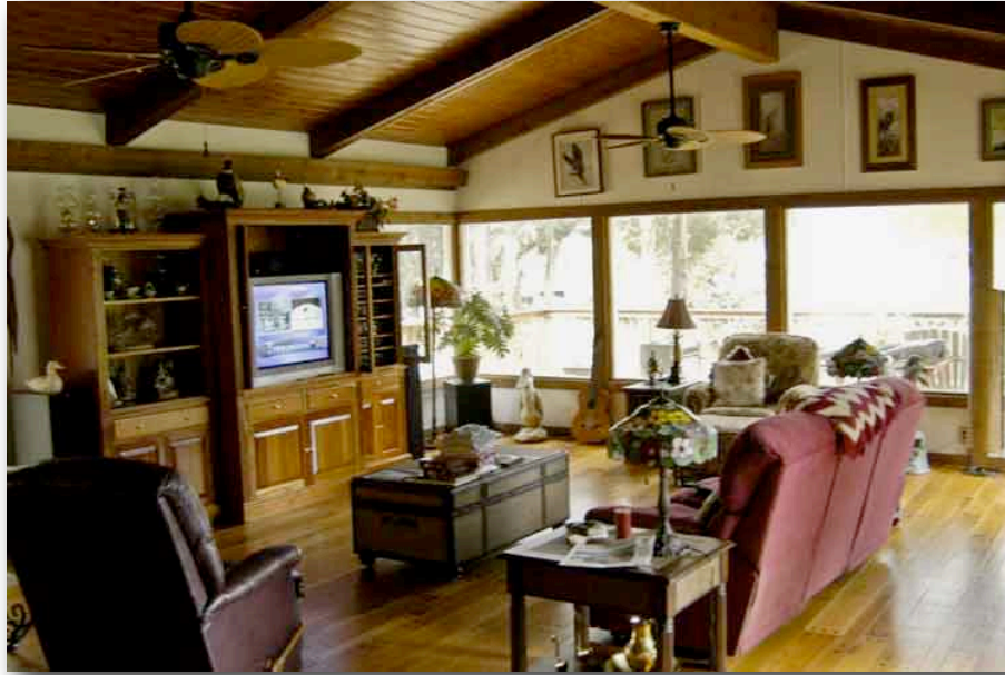
Great Room Overlooking Deck and River