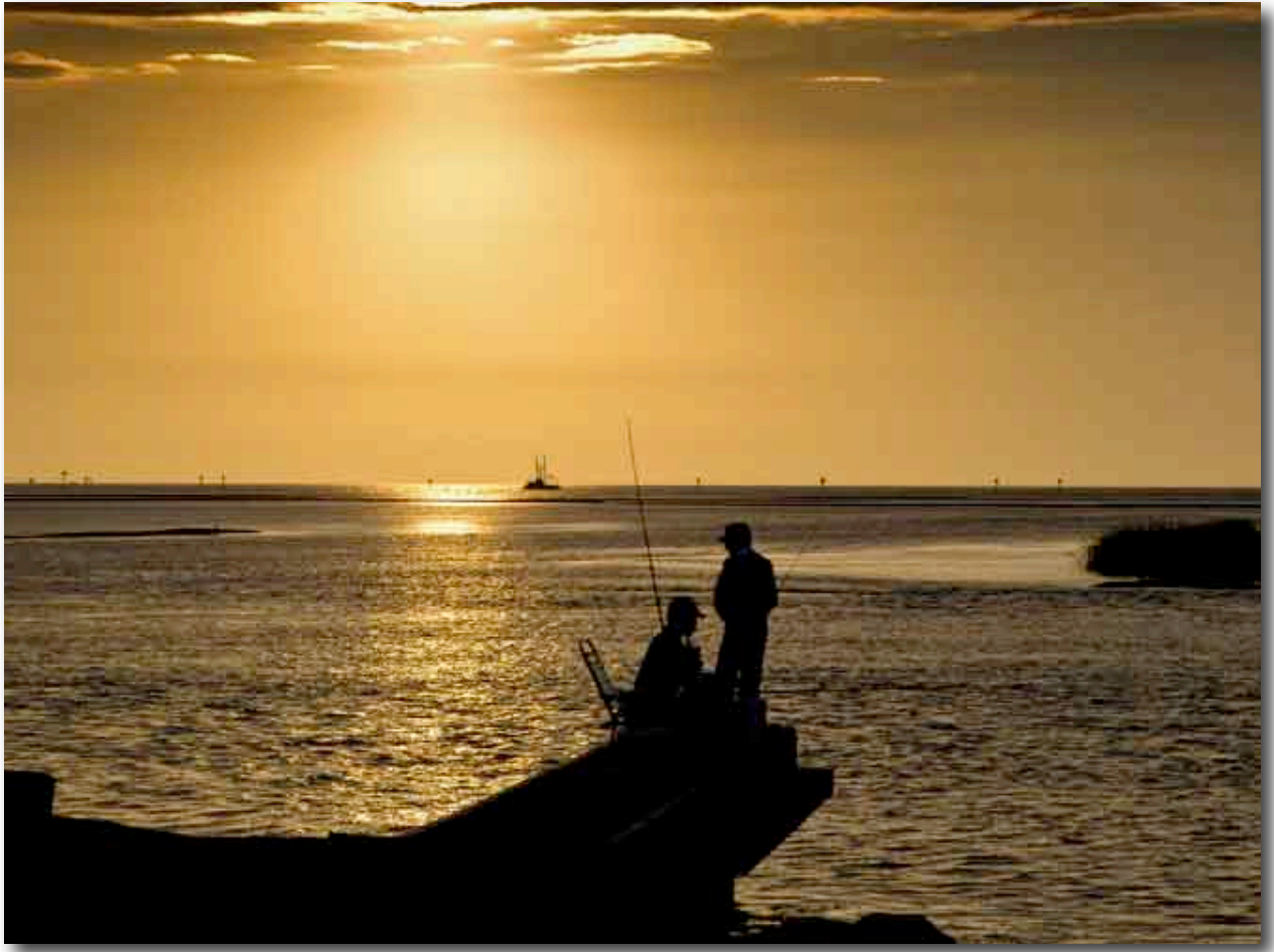
Fishermen at the mouth of the Withlacoochee River at sundown