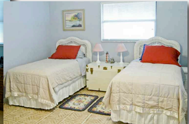
Typical Guest Bedroom