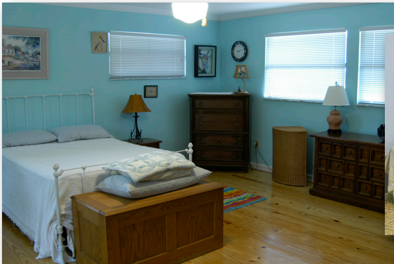
Master Bedroom on Second Floor