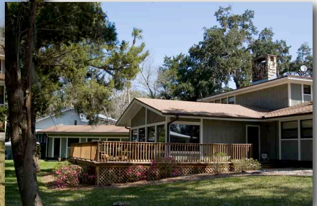
Deck Overlooking River