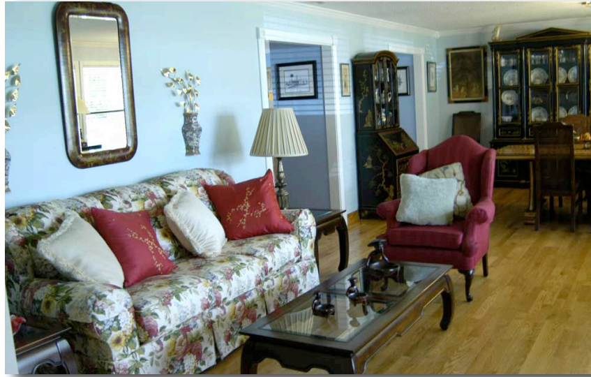
Living Room/Dining Area