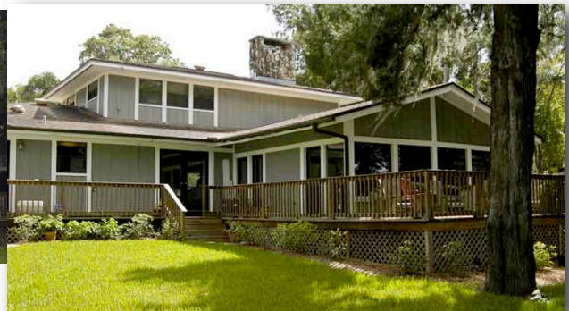
Views from the River