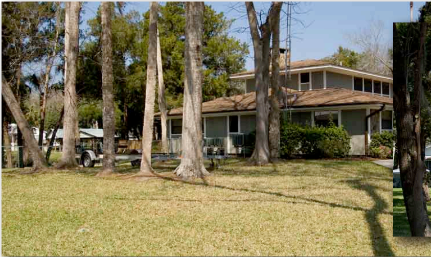
View from Street