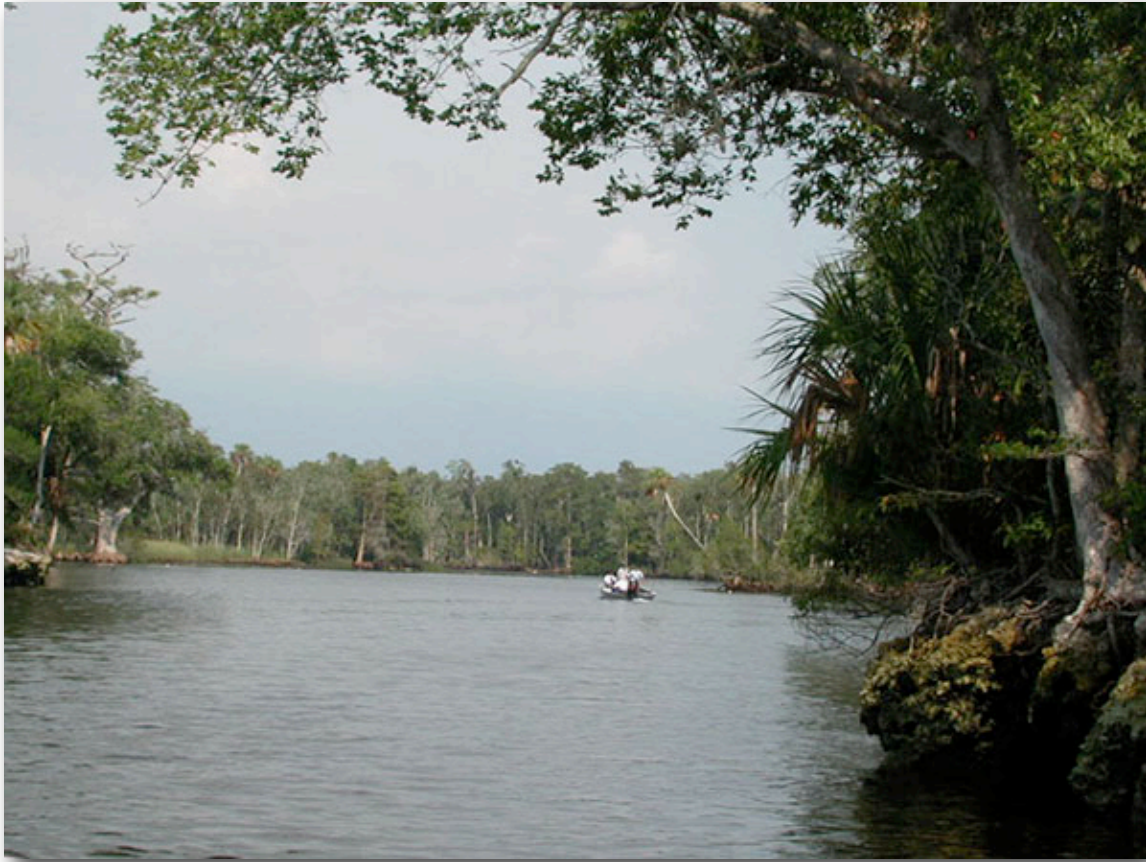
The Withlacoochee River Near the Gulf of Mexico